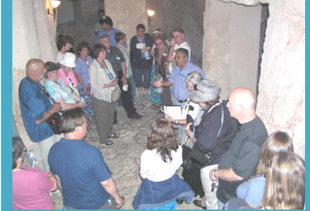
The dungeon in what is believed to have been the house of Caiaphas, the High Priest. This is the view from inside the dungeon where Christ spent the night before His crucifixion. In the first century, the only entrance to the dungeon was through a round hole through the stone ceiling.