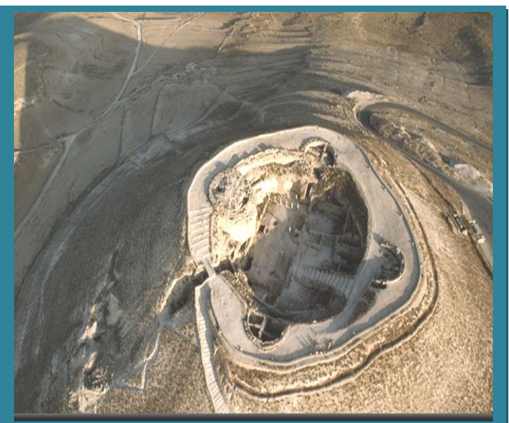
Herodium - the location of the tomb of Herod the Great

On the left is a sketch of what archaeologists believe the palace/fortress looked like.