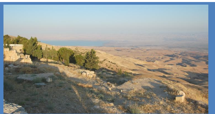
Westward view of the Promised Land from Mount Nebo Moses dies here because God did not allow him to enter.