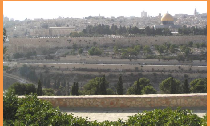
Today's view of the Temple Mount from near where Jesus wept over Jerusalem - Today called Dominus Flevit, meaning "the cry of the Lord" or "The Lord wept."