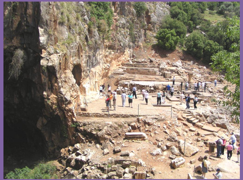
Caesarea Philippi - the most northerly place recorded in the Bible where Jesus and the Disciples went.