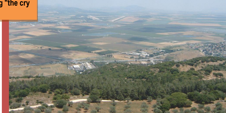
Valley of Megiddo as seen from the Carmel Mountain Range. Also known in Scripture as the Jezreel Valley and the Valley of Esdraelon.

• What location will be a staging area for the Battle of Armageddon? See photo at right.